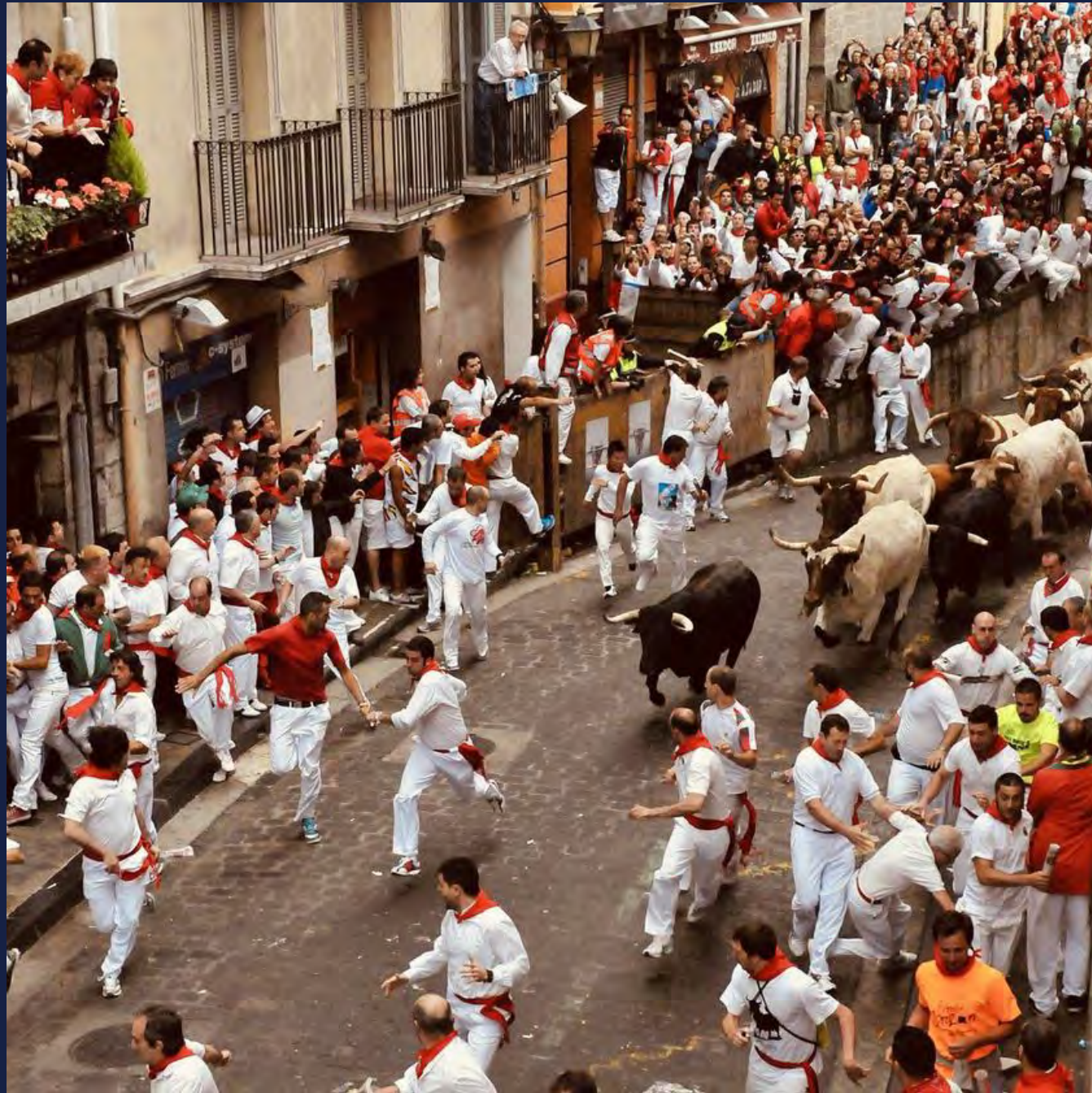
San Fermín - July